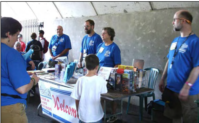
Clockwise from upper left: The New England Region's hospitality table at Six Flags New England; view of the Mad Mouse from Lake Quassapaug aboard the Quassy Queen; waiting for the Mad Mouse at Quassy*; ACE recognizes the Thunderbolt at SFNE as a Roller Coaster Landmark. with a commemorative plaque; New England Region volunteers welcome attendees to Lake Compounce; waiting for the Quassy Queen; it was easy to spot the official hospitality team t-shirts!