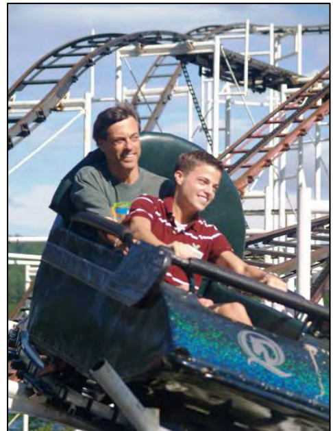
Riders enjoy Quassy's MAD MOUSE