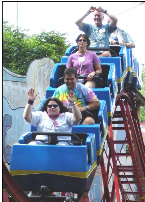
Enjoying THE GREAT CHASE at SFNE